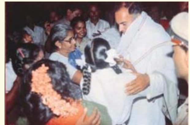
Dhanu (I.I.) approaching Rajiv Gandhi

Does evidence imply suicide bombing is rational , at both the individual- and organizational-levels?