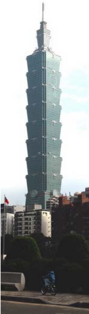
"101 Taipei" - Largest

Politics in Taiwan are confusing if not convoluted. Taiwan is still officially a province of China, yet it continually agitates to be recognized as a separate country. During our visit we often saw huge signs that say "UN for Taiwan." Since the 1990s they have had a democratically elected government. The most powerful party, the KMT, and its affiliated Blue coalition parties seek eventual reunification with China but with considerable control. The Democratic Progressive Party (the DPP) and its party coalition of Green parties promote independence for Taiwan but not wanting the wrath of China, they promote the status quo. The stalemate between Taiwan's Greens and Blues ironically is incapacitating much like