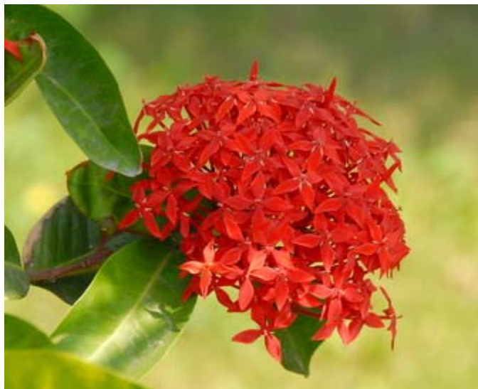
Ixora Stricta Roxb, flowers found in Taiwan & SE Asia