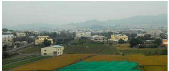
Typical village and farms in Central Taiwan as seen from the window of the HSR, one of the worlds fastest trains

As we watched the terrain stream by on the train, Nancy remarked how neat the fields and irrigation looked. Most of the farm houses were shaped like square match boxes. But they tended to be large and well kept. From the train windows we saw few mountains but lots of well cultivated farms.