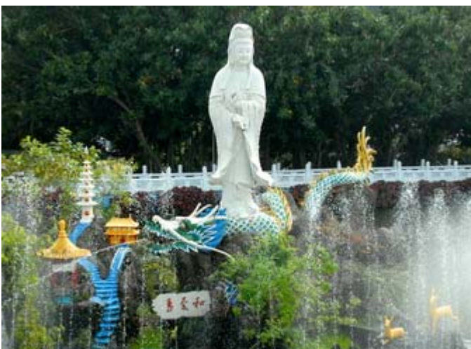
Goddess of Great Compassion, Avalokitesvara

A Buddhist nun served as guide through the entire tour, which lasted about four hours. The first stop was the Shrine to Great Compassion. The center of the shrine is a statue of Avalokitesvara a kind of goddess or exemplar of compassion. The statue and its surroundings created a quiet, peaceful atmosphere.